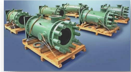
HCl pickling liquor heater