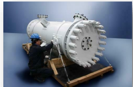
Chlorine incinerator scrubber unit, weak acid cooler