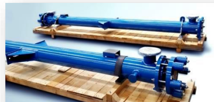
Sulfuric acid 85 % - 160 °C cooler