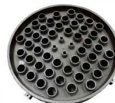
Tray in GT-KELITE for distillation column (MCA process)