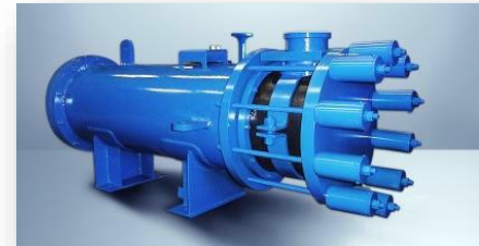
Reactor condenser for xylene / thionyl chloride, pharmaceutical